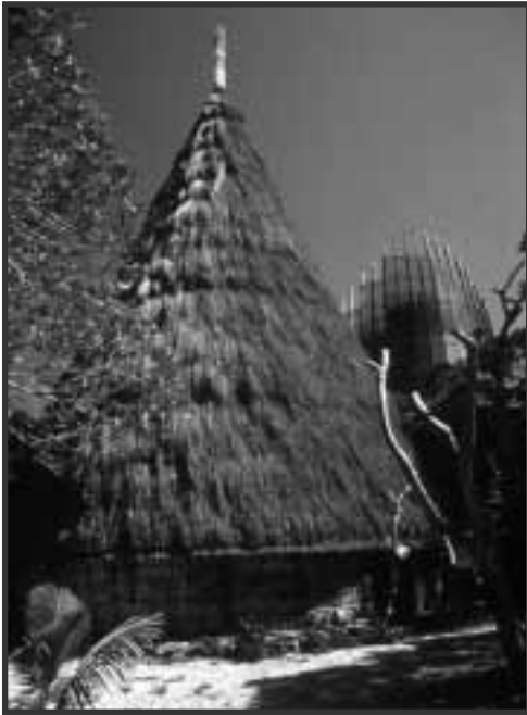
Traditional Kanak Grand Chief's hut in foreground and one of the Centre's towers in background.

Photo: P.A. Pantz, © ADCK/Renzo Piano Building Workshop.