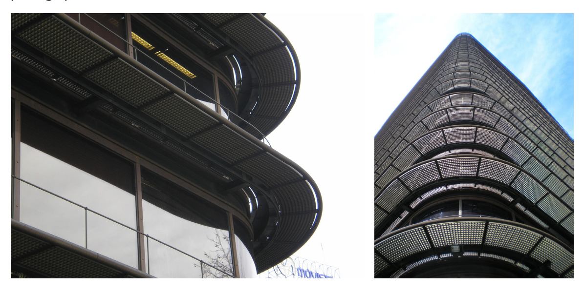
FIGURE 3. Banco de Bilbao, Madrid, 2008, Corner Marquesina and solar protection details, photographer: César Martín Gómez.

(crucial data in cooling facilities) has led to the adaptation of screen or visors" [4]. This comment is further developed with his discussion of the need to create "permeable voids facilitating the revitalizing action of the sun's rays (a radiation close to ultraviolet) and conversely opaque to thermal transmission so as to not only prevent heat and cold penetration but also to reduce to a minimum the thermal consumption of the climate created by the building's artificial systems" [5].