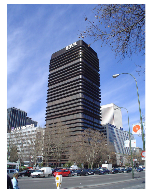
FIGURE 1. Banco de Bilbao, Madrid, 2007, exterior perspective.

The building, which serves as the Banco de Bilbao headquarters, is situated in the Castellana Promenade in Madrid and is the result of a successful bid for a specific site forming part of an urbanism plan by Azca and A. Perpiña in 1954 (Fig. 1). The competition was held between 1971–1972; the project execution took place between 1972–1974; and the building's actual construction between 1974– 1981. This was all completed with a budget of 2.200.000.000 pesetas.